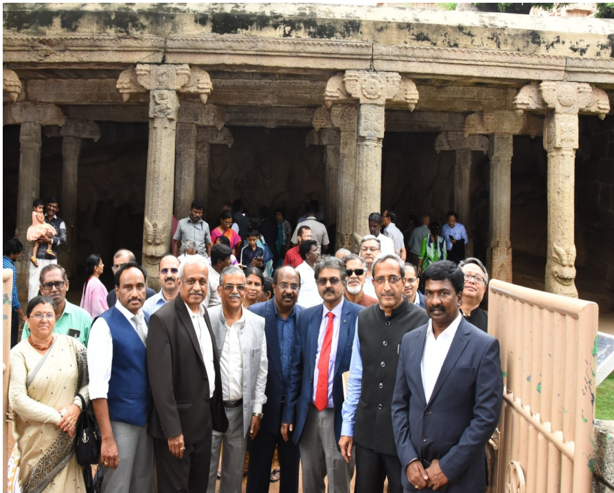
The Participants of NFICI meeting at a Heritage site in Mahabalipuram