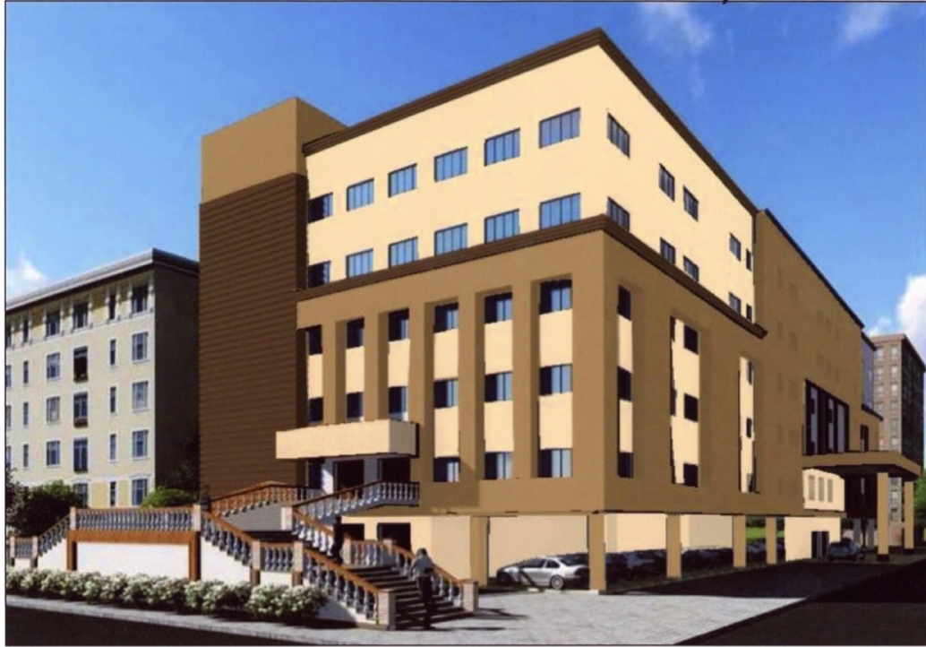
View of State Information Commission building at Government Farm Village, Pernpet, Nandanam, Chennai-35